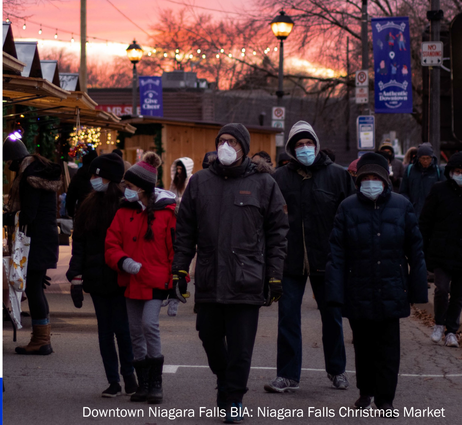
Downtown Niagara Falls BIA: Niagara Falls Christmas Market